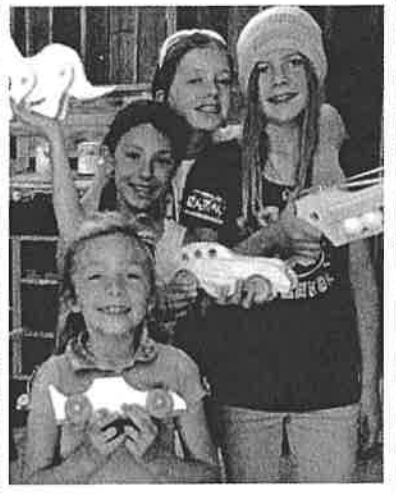
AFTER SCHOOL PROGRAM